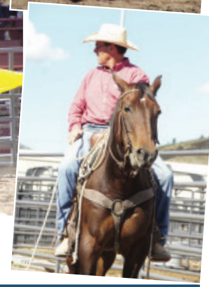
Moments from the 2023 event.

trainers overcome some hangups they may be having, to evaluate what the trainers have accomplished, and to validate the progress of the horses. Steve said, "Some folks just get so close to making it to the top of the hill and just need a little help to get over the top and find out how good it is on the other side." The Back on Track clinic also aids to renew the excitement that is present on the initial pick up day when the horses are received by the trainers.